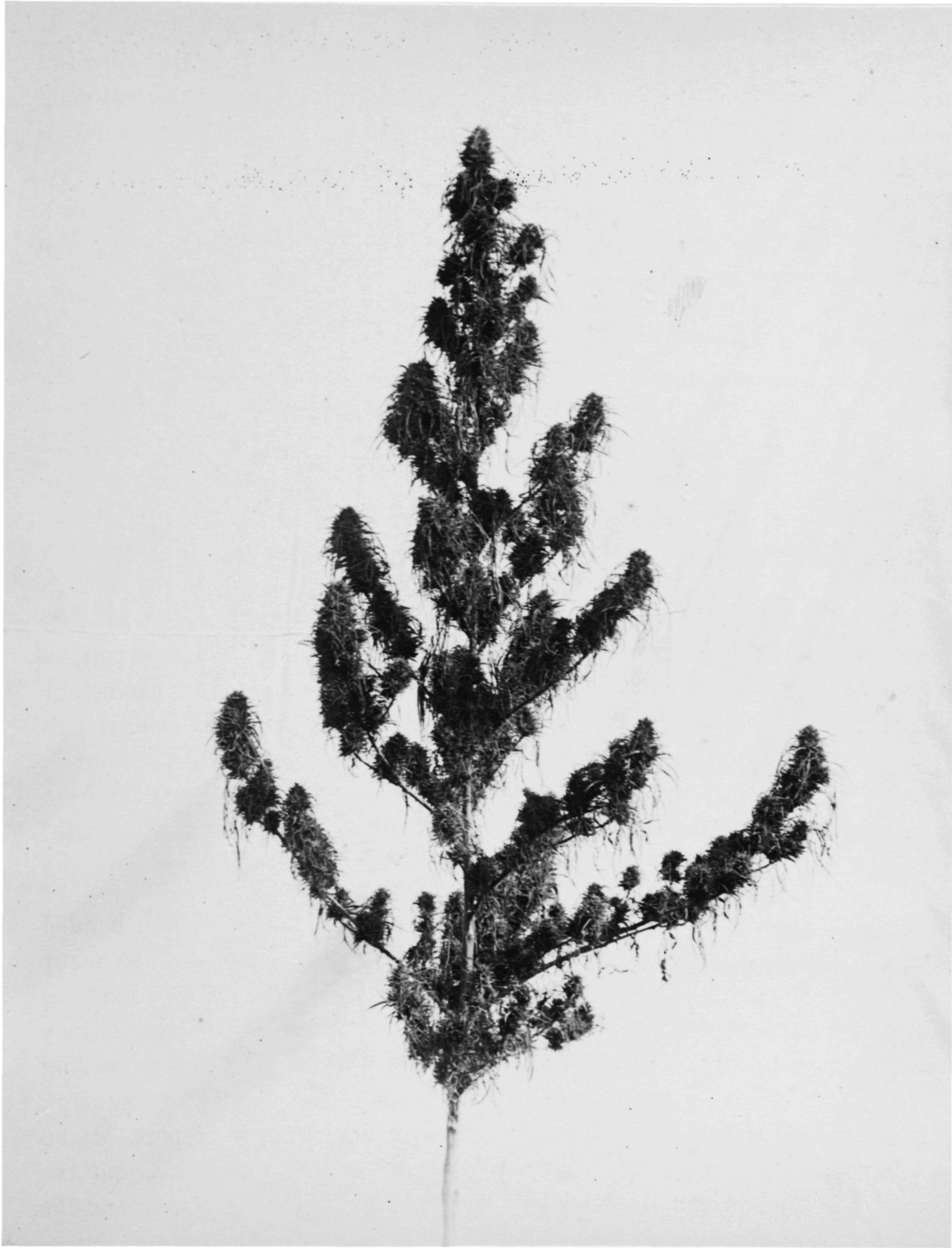
Survey of India Offices, Calcutta, August 1894.

GANJA PLANT READY FOR CUTTING, SOME OF THE DRIED LEAVES STILL ADHERING, NAOGAON.