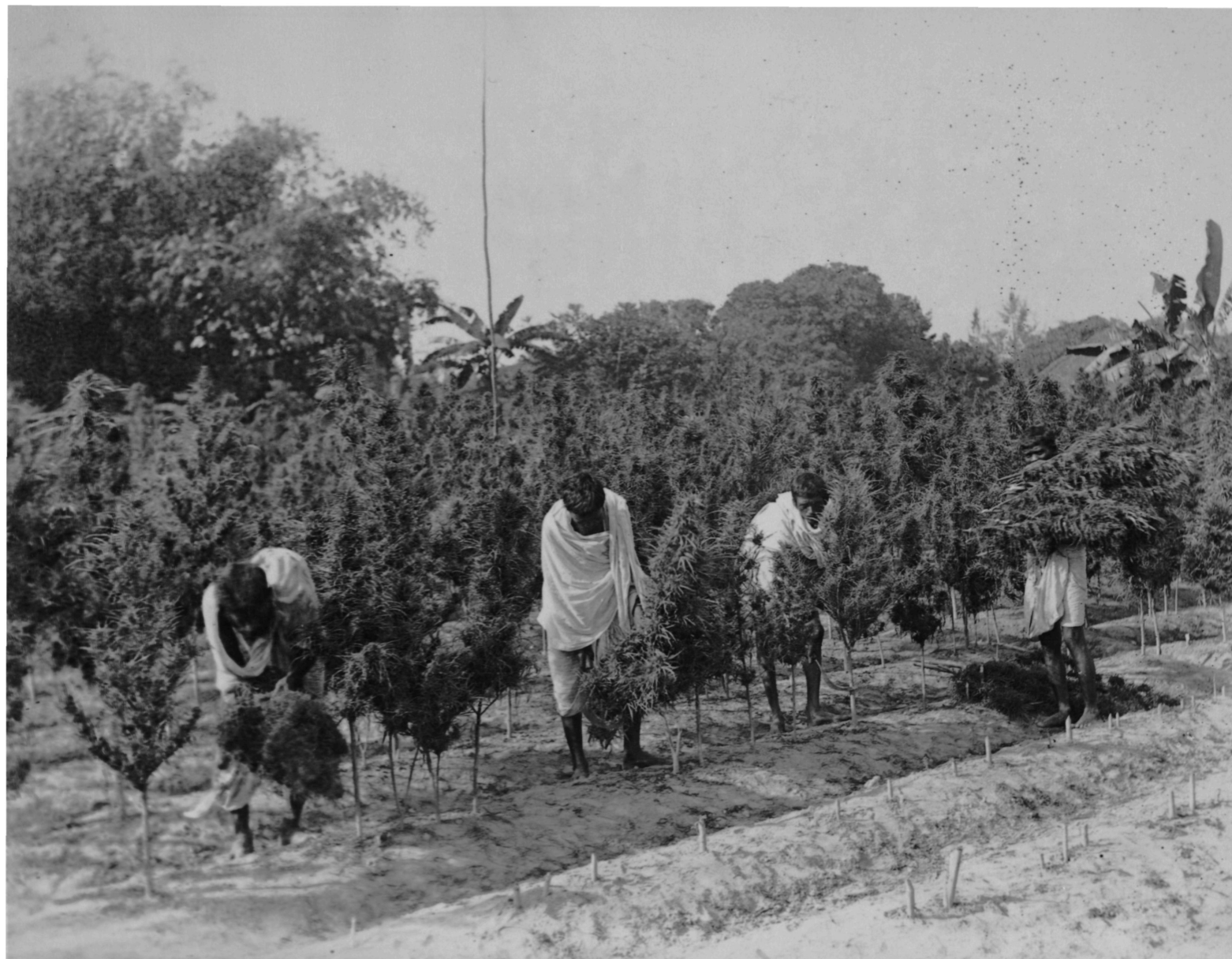
Survey of India Offices, Calcutta, August 1894.